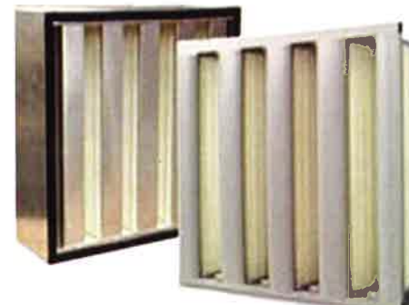
Filters (HEPA/Fine/Pre/Mini Pleat & Roll Filter)