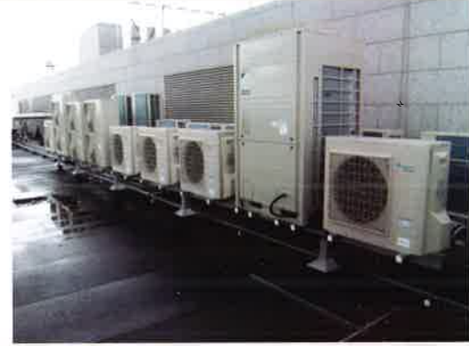
AHU & Chiller(Centralized Air-Conditioning)