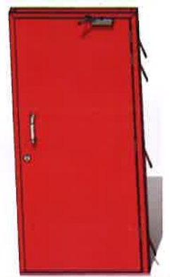
Clean Room Doors SS/GI (High Speed Shutters & Fire Proof Door)