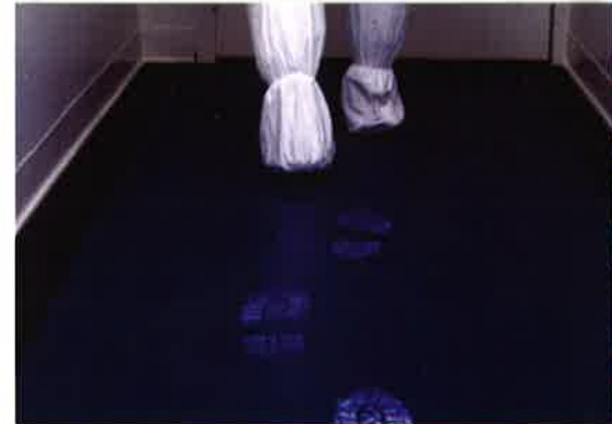
Clean Room/ESD Consumables