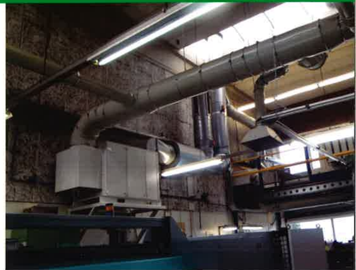
Fume Exhaust System