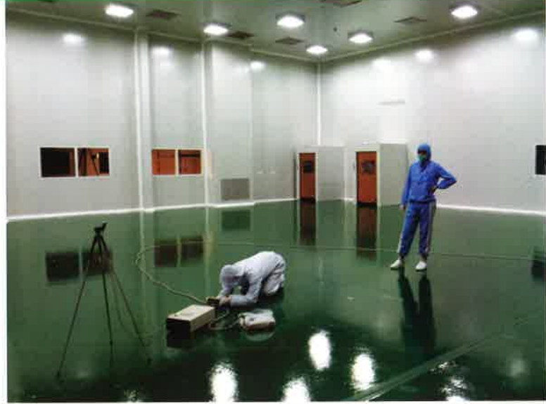
Clean Room (Class 100~100000 Class)