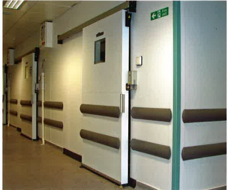
Modular Cold Room