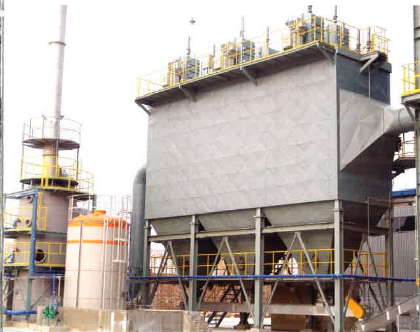
(ESP) Electrostatic Precipitator