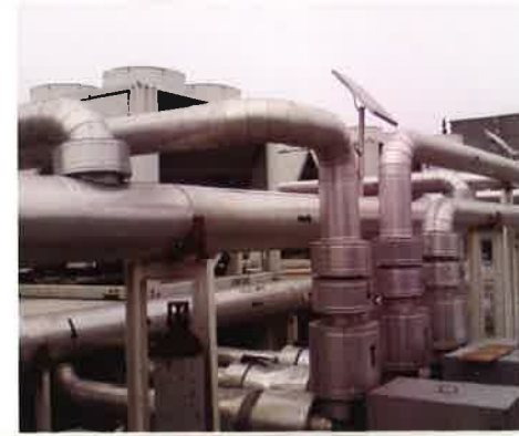
Ducting, Piping & Insulation (SS/GI/MS/PP & Fabric)