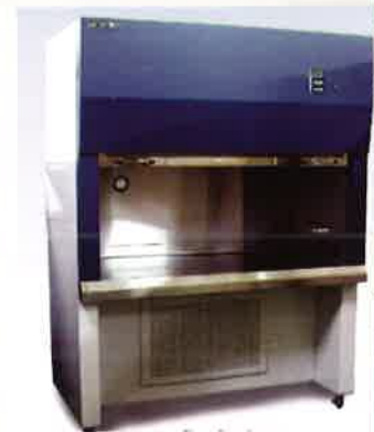
Clean Room Equipments (Pass Box, Air Shower, Laminar Air Flow, Clean Booth)